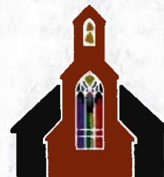
St Dunstan of Canterbury Anglican Church